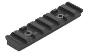
8-SLOT / MTURS09M