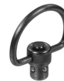
1.29" C-SHAPE LOOP