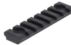
7-SLOT / MTURS10M