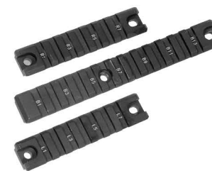
13-SLOT X1, 7-SLOT X2